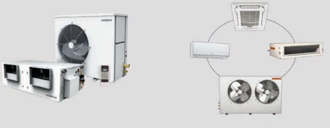
Toushi/Eco Flexi split AC