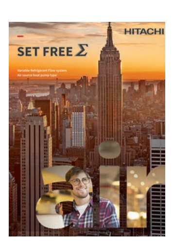
VRF SET FREE ∑ Brochure