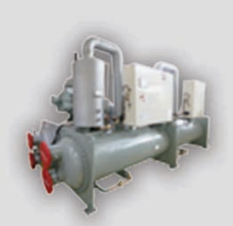
Water cooled screw chiller