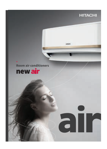
RAC_CTB & Brochure